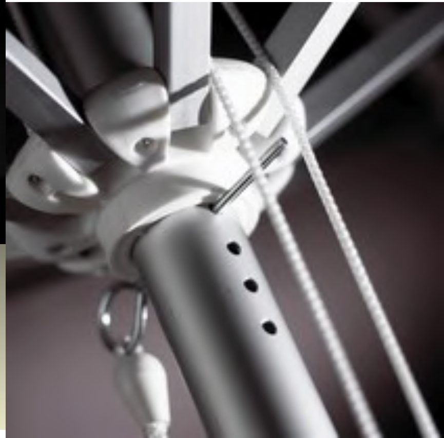
Rope Pulley System