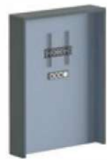
Kama LF79 1500*2100*400mm