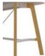
color : nature wood color ( standard )