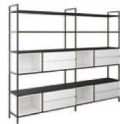
Pampas T0091HS 2400*370*1970mm