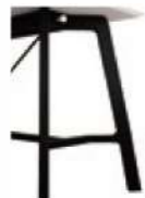
color : black ( customize option )