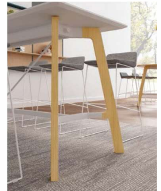
Table feet using imported non-section of ash wood, surface coated with imported environmental protection wood wax oil, natural environmental protection and clear texture.