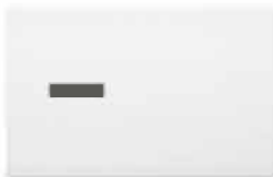
color : white ( standard )