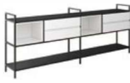
Pampas T0091LS 2400*370*900mm