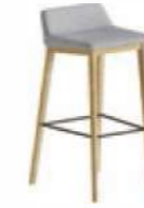
Bamni P607-1 420*500*870mm