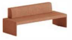
Purus A9013-A 2000*700*730mm