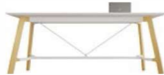
color : white ( standard )