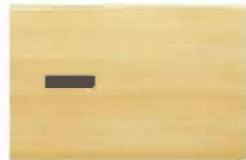
color : nature wood color ( customize option )