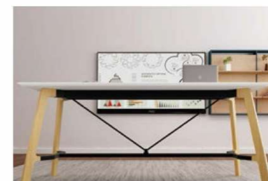
The Harper series negotiation table impresses people with its stability and perfect design.

1.5mm thickness Square tube base frame, coated with German Oxyplast powder. The V-shaped Dia15mm solid inclined rod design not only strengthen the overall firmness and stability of the table, but also increase the decorative and ornamental properties, perfectly Integration.