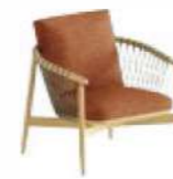
Grande A9001 795*767*800mm