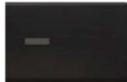
color : black ( customize option )