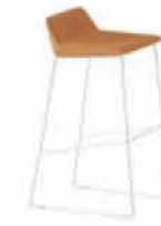
Bamni P607-2 420*500*870mm